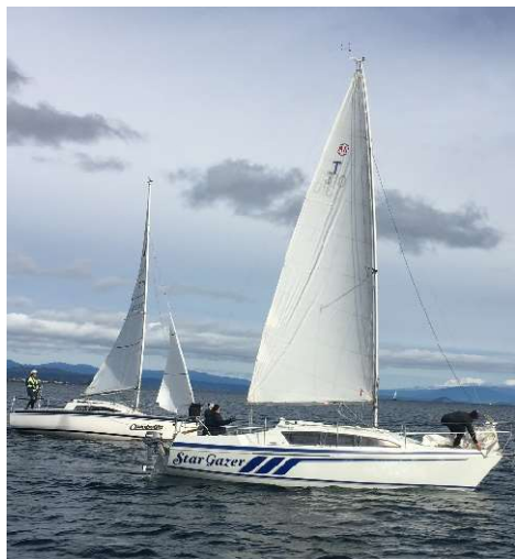
Carabella & Star Gazer out during the winter series.